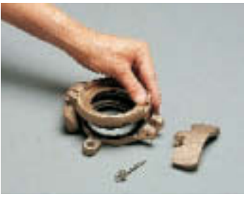
11. Compress the Check Valve Packing Diaphragm Plate and attach the Check Valve Weights with the cotter pins and washers.