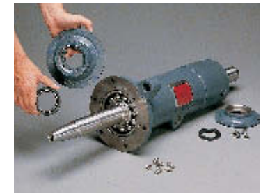
Place Oil Seals into the Front and Rear Bearing Caps and attach to the Long cylinder. Note: Front Oil Seal is designed to keep impurities from reaching the bearings. Mount Seal with spring forward.