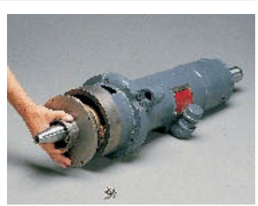
15. Attach short Cylinder Head to Short Cylinder and secure with s