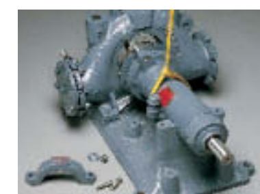
17. Install Bearing Unit in rear bore of Intake Chamber Attach Pedestal Cap and Draw Bolt Nut and Washer. Do not tighten at this time.