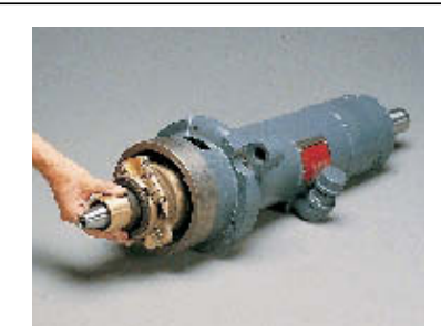
14. Slide the Check Valve Assembly onto the Shaft and tighten the Setscrew in the notch on the Shaft. tighten the Se