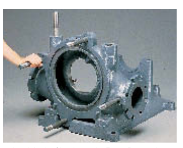
1. Attach Intake Chamber to the Frame Base and install the Case Stud Bolts