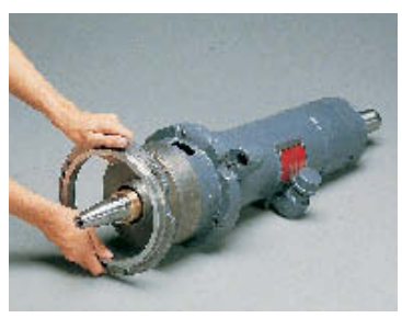
16. Place Gland Ring over the Short Cylinder.