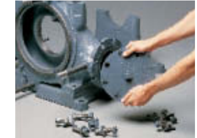
3. Bolt the Blind Intake Flange onto the Intake Chamber. Note: Wilfley Model K pumps will accept intake from either, or both sides of the pump.