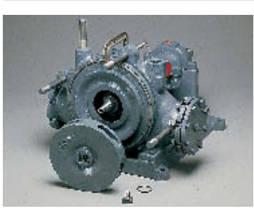
21. Slide Expeller O-Ring Runner onto the Shaft and secure with Runner Bolt. (Expeller O-Ring for two-piece Runner only). Note: C-Clamp may be useful in holding the Follower Plate in position.

This pictorial guide is to be used only as a general