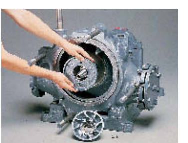
19. Install Die Ring and secure with screws. The Expeller portion of two-piece runners must be installed at this time.