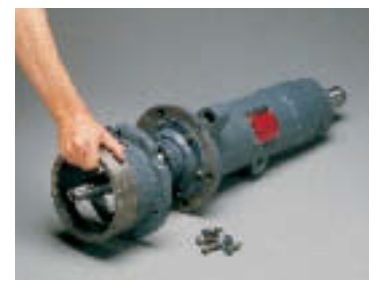
8. Attach short cylinder to the Long Cylinder. Note: dished edge of the Short Cylinder must line up with the Draw Bolt Fitting on the Long Cylinder.