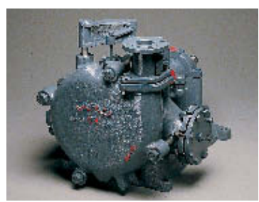
25. Attach Discharge Keeper Assembly.

Please refer to exceptions as noted in the K Operating Handbook. Before working on your pump, please read all instructions and warnings carefully, and observe all safety precautions.