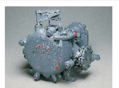
24. Attach Crane Arm Assembly.