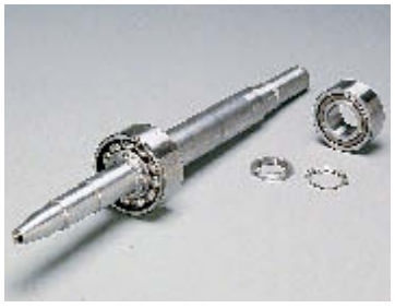
5. Heat Bearings and slide them onto the Bearing Shoulders on the Shaft. Lock into place with Lock Nuts and Lock Washers.