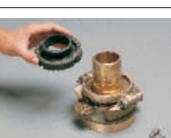
13. Slide the Check Valve Spider Assembly onto the Check Valve Sleeve, secure with screws. Position the Check Valve Packing Diaphragm on the Check Valve Packing Diaphragm Plate