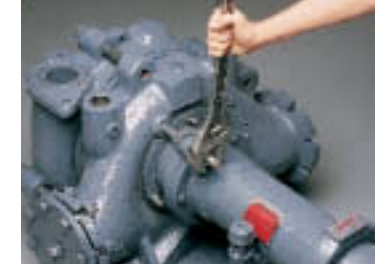
23. Set Runner Clearance. For specific instructions refer to page 5 of the Model K Operating Handbook. Tighten Pedestal Cap and Gland Stud Nuts.