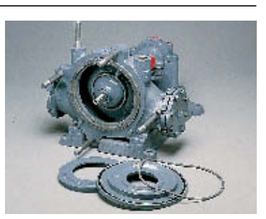
20. Install Frame Protecting Ring, Follower Plate and follower Plate Gasket into Front Bore of Intake Chamber.