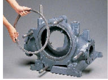
2. Insert the Frame Packing Ring into the groove on the front face of the Intake Chamber