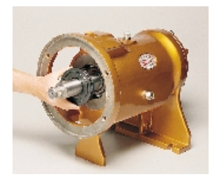
7. Install Inboard Oil Seal (67) into Frame.Check the seal specifications to be sure it is installed properly.