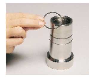
11. Place one Shaft Sleeve O-Ring (18) into the groove on the inside of the Shaft Sleeve