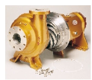
28. Install the Case Gasket (3) and Case (1) onto the Frame. Be sure the Frame is filled with lubricant to the proper level.