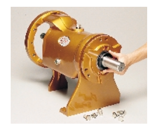
6. Secure the Shaft Assembly to the Frame. Install the Outboard Oil Seal (76) being careful not to damage O-Rings during installation. Some seals have a drain on the bottom. Be sure the seals are installed