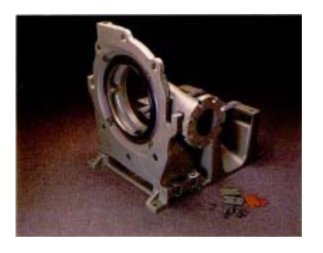
7. Seat the intake chamber into the bracket. Be sure to attach the drain and vent plugs on either side of the intake chamber.