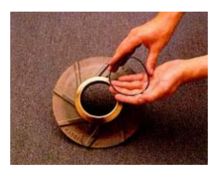
10. Place the shaft sleeve o-ring in the inner bore of the shaft sleeve.