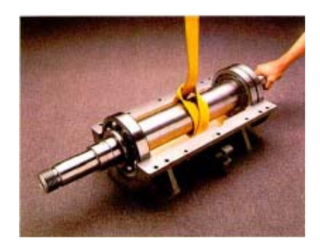
2. Place the shaft assembly in the lower half on the long cylinder.