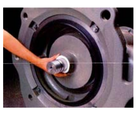
15. Slide the expeller onto the shaft and seat against the rear die ring.