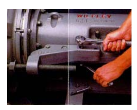
23. Attach the draw bolt assembly to the frame. A washer and nut should be on each side of the lobe that extends from the draw bolt bracket.