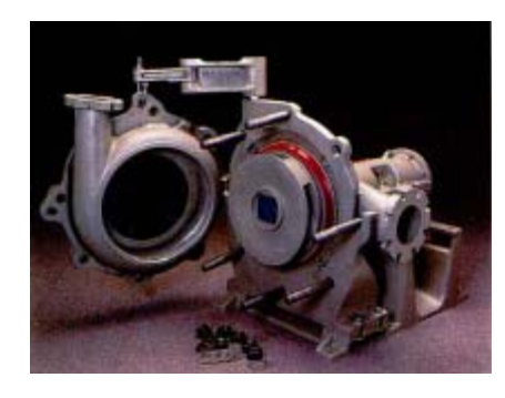
20. Place the case shell gasket on the case shell and attach the case liner to the case shell. Attach the case to the crane arm.