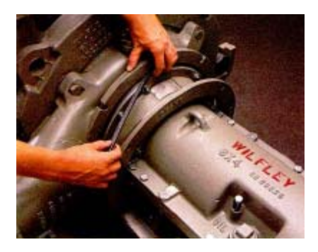
22. Remove the gland ring and install the gland ring packing. Retighten gland ring in place.