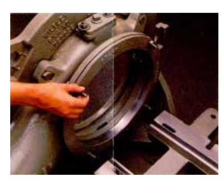
8. Place the gland ring on the intake chamber. Hand tighten only. This part will be removed later to add the gland ring packing.