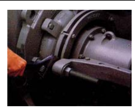
24. Adjust the runner clearances with the drw bolt assembly. Once runner is adjusted properly, securely tighten long cylinder to the frame.