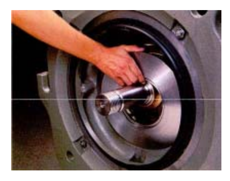
12. Place the die ring holder over the shaft so that it seats flush with the front bearing cap.