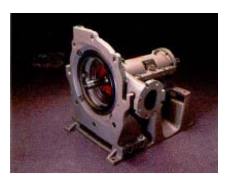
9. Slide the long cylinder onto the frame and through the intake chamber.