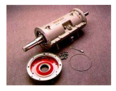
5. Install the bearing caps and bearing cap o-rings to th long cylinder.