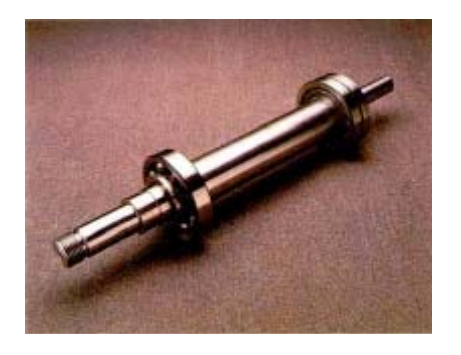
1. Install bearings on shaft and lock into place with locknuts and lockwashers.