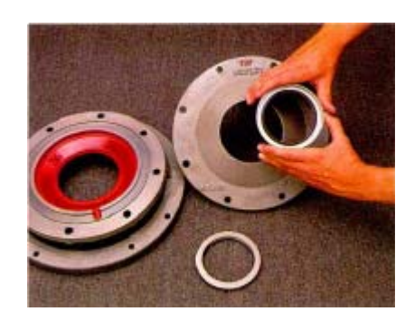
4. Place the oil seals in the front and rear bearing caps.