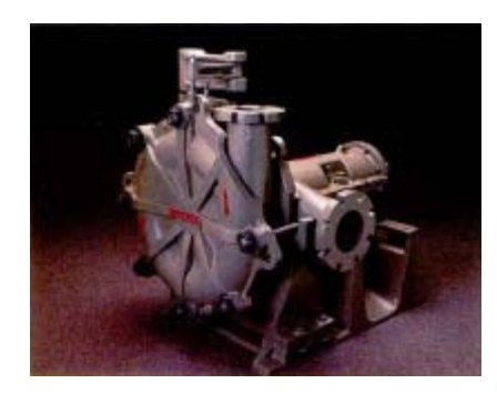
21. Securely attach the case to the bracket.