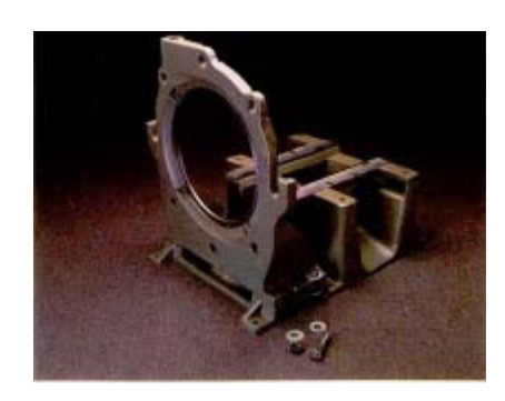
6. Securely attach the bracket to the frame.