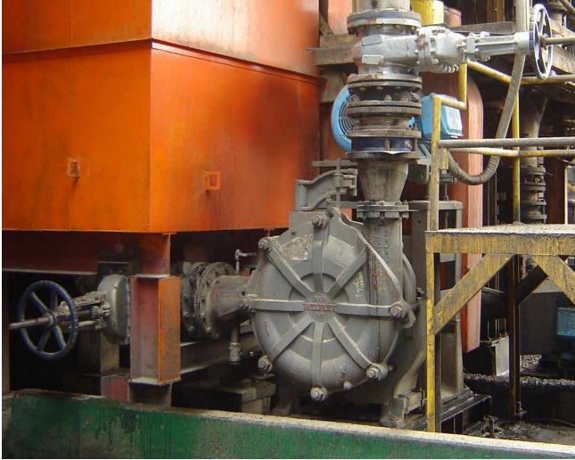
Model HD pump